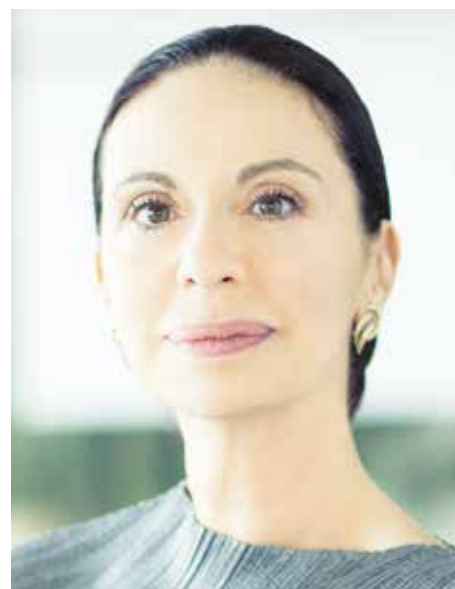
About Cristiana Longarini

VSY combine master craftsmanship and cutting-edge know-how with classic Italian flair and are respected as an ethical construction specialist. Using recyclable materials in build, VSY integrate new innovations in water treatment and emission reduction,