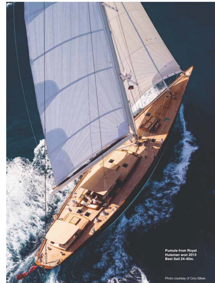
Pumula from Royal Huisman won 2013 Best Sail 24-40m.