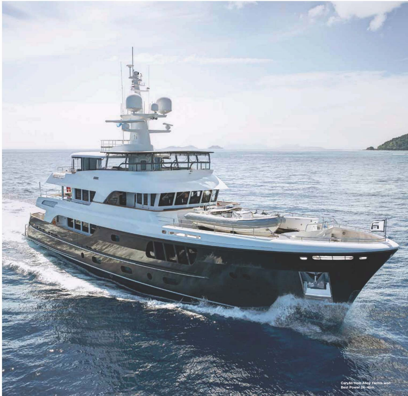
CaryAll from Alloy Yachts won Best Power 24-40m.