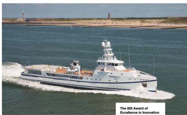
The ISS Award of Excellence in Innovation was for the Damen-built 67m Fast Yacht Support vessel, Garçon.