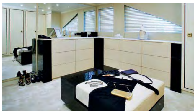
Owner's wardrobe: the mirrored façade creates a feeling of space.