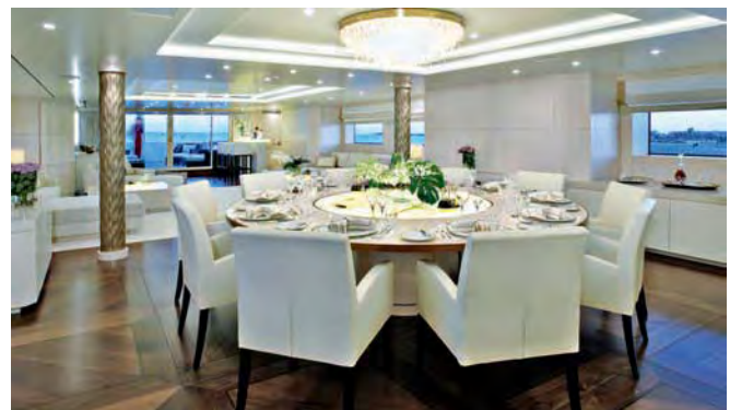
Incandescent chandeliers: the dining area is flanked by two pillars.