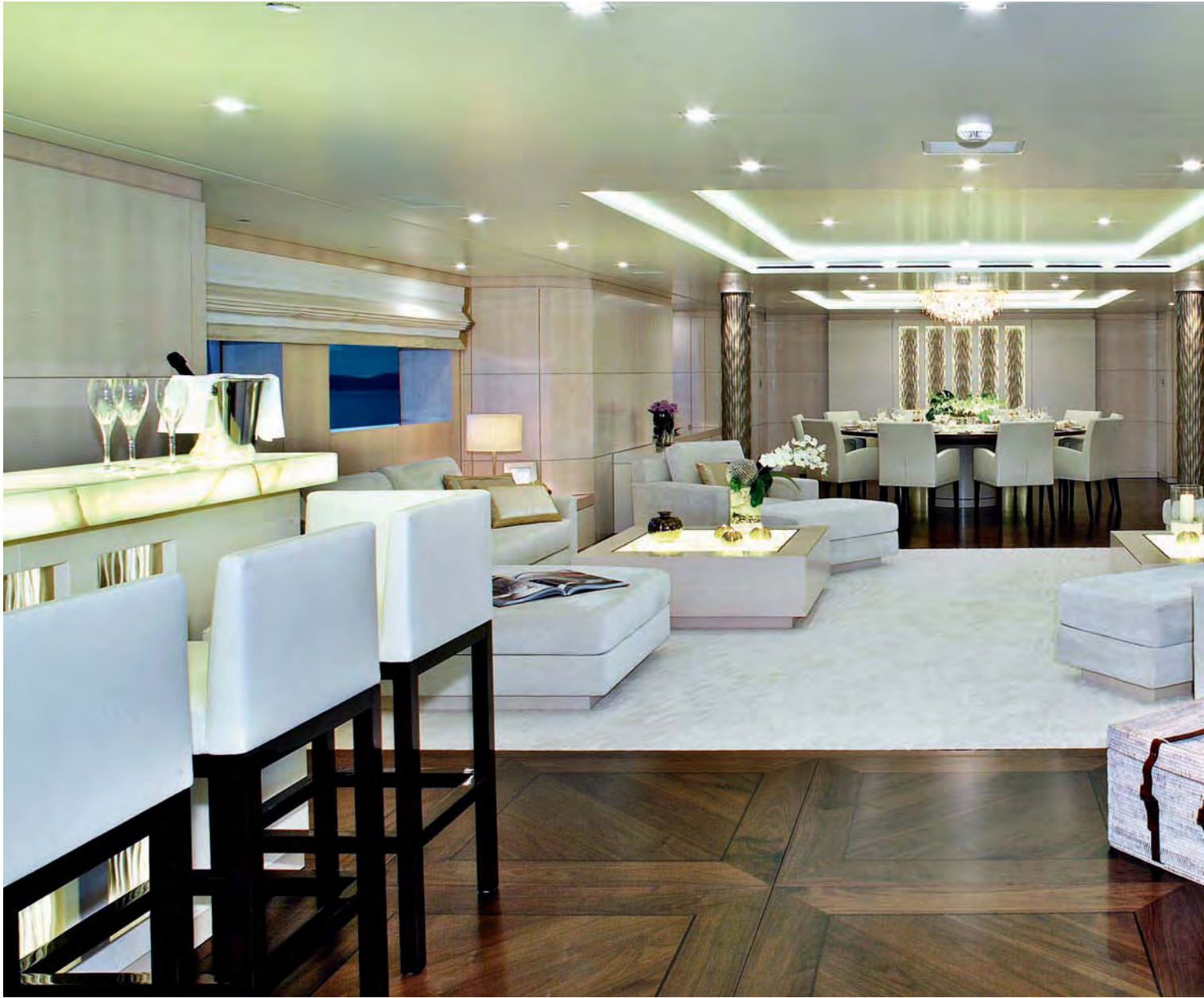
Saloon with bar and dining area: the dominant white is complemented by moderately applied bluish-green shades and gold details.