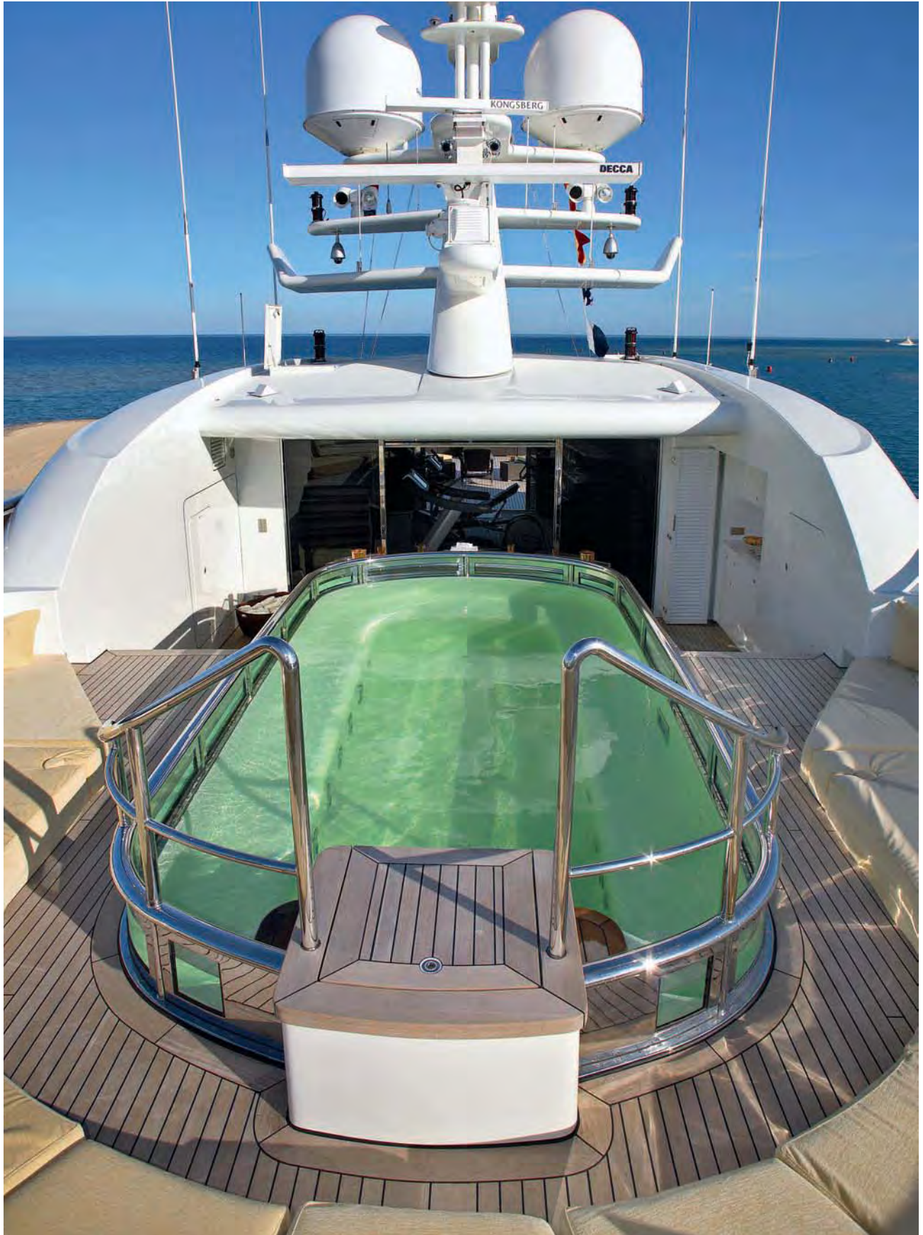
Fit for training: the pool's countercurrent system allows one to swim vigorously. It can be used as a Jacuzzi by the whole party too.