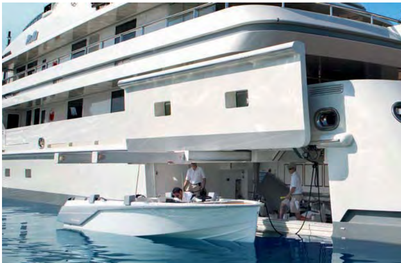
Side hatches: the Frauscher Type 686 tender goes alongside beneath the davits.

twice the normal size. Here mother of pearl on the walls sets the tone. However visitors encounter a quite particular interior highlight in the central stairwell, the steps of which spiral up around a cylindrical glass lift. The walls are covered in white panels, featuring overlapping, relief-like, circular patterns – a milled masterpiece that posed quite a challenge to the Hamburg interiors firm, Gehr. The interplay of shadows absolutely delighted the owner. However the layout too is also striking here. “Why