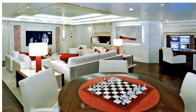
Upper deck: a gambling table completes the set in the skylounge.