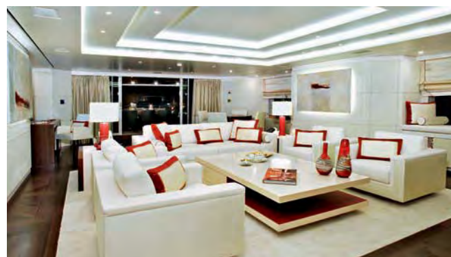
White and breezy red: the designers added just a touch of colour.