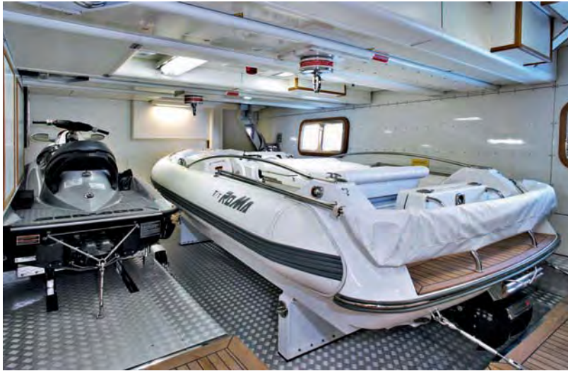
Garage: the Castoldi Jet 16 shares the double space with a fast Seadoo bike.