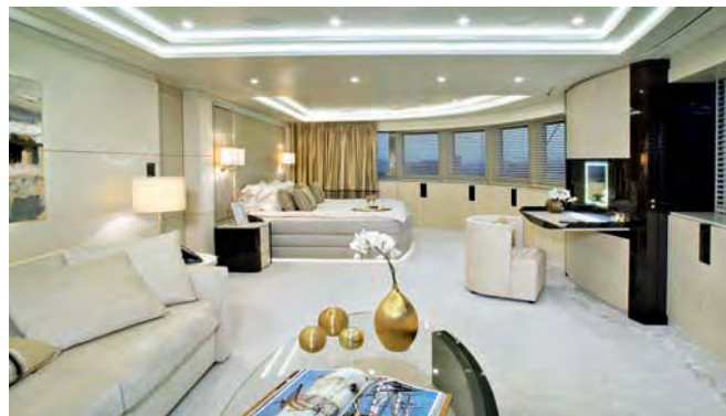
Owner's bedroom: the bureau forward provides the focal point.