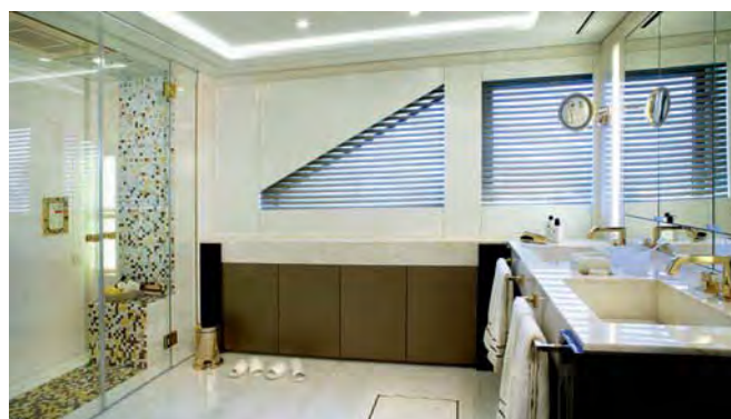
Owner's bathroom: a panel to the rear closes off a slim hammam.