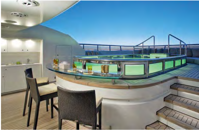
Pool bar: Newcruise installed Dedon furniture at the bar by the swimming pool.