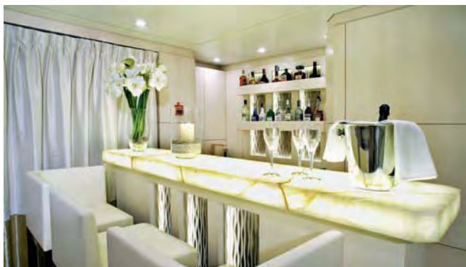
Radiant bar: the bar consists of a thin layer of onyx laid on GRP.