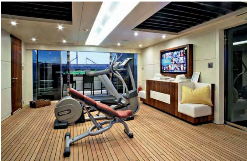
Fitness centre: the gym equipment is on stand-by on the sundeck aft of the pool.